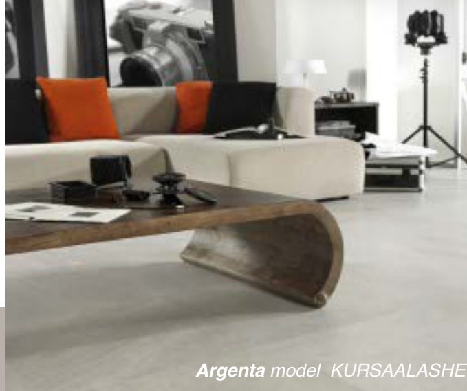
Argenta model KURSAALASHE