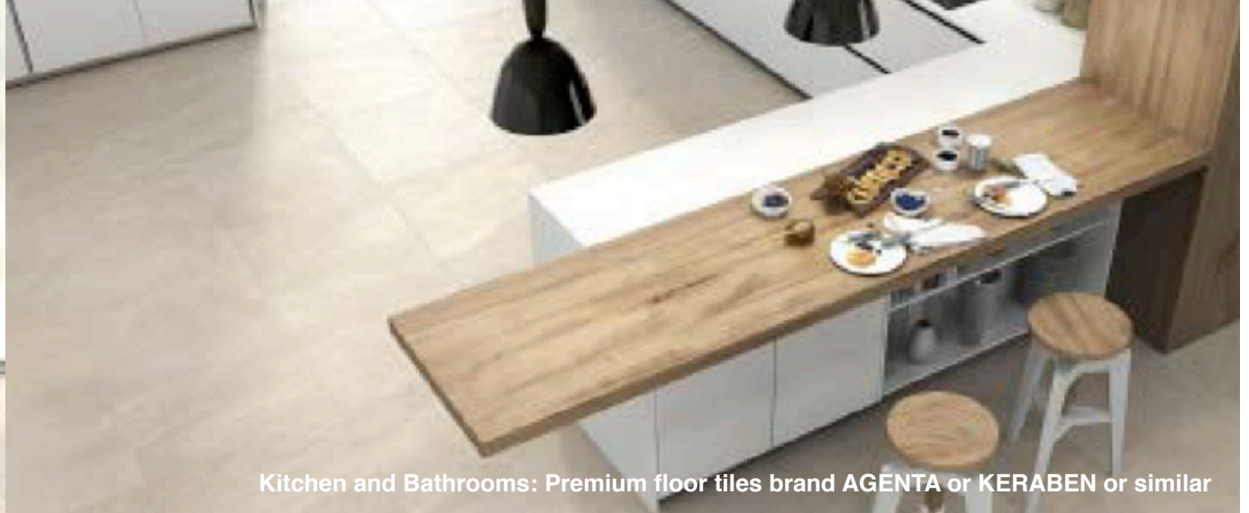
Kitchen and Bathrooms: Premium floor tiles brand AGENTA or KERABEN or similar